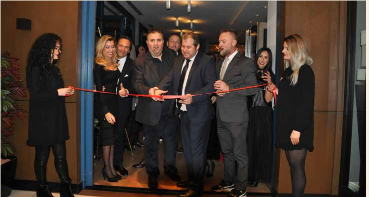
THE NEWEST COHIBA ATMOSPHERE IS NOW LAUNCHED IN TIRANA, AT DELANO LOUNGE RESTAURANT.

On January 8 th stylish cocktail marked the opening of Cohiba Atmosphere Tirana, which by the beginning of 2018 is the 14 th in the world and the 4 th for Europe. Over 100 guests attended the event merging with the cozy atmosphere, classy drinks and bites and the scent of Cohiba Robustos smoke. In addition to a rich portfolio of the finest cigars in the world,